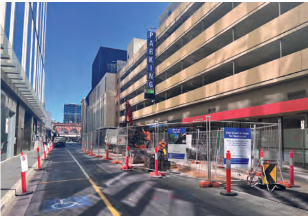
Above: streetscape improvements are underway for Pitt Street. Below: an artist's impression of how it will look when completed.