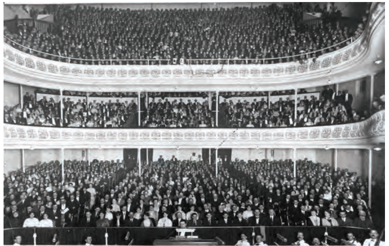
Opening night at The Tivoli (now Her Maj) in 1913 and below, the recently rejuvenated Her Majesty's Theatre.

For more information visit: www.adelaidefestivalcentre.com.au/whats-on/exhibitions